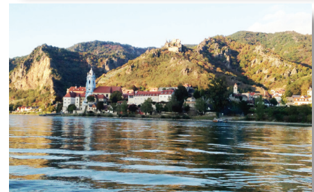
Melk Abbey and Dürnstein in Austria's Lower Wachau Valley