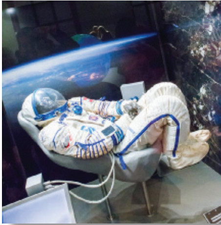
Franz Viehbock's flight suit, on display at the Vienna Museum of Natural History

a space borne Chinese-Austrian experiment on entangled quantum particles. US astronaut Franklin Chang-Diaz concluded the session with a remote presentation from Houston on the technical specifications and merits of his Variable Specific Impulse Magnetoplasma Rocket (VASIMR).