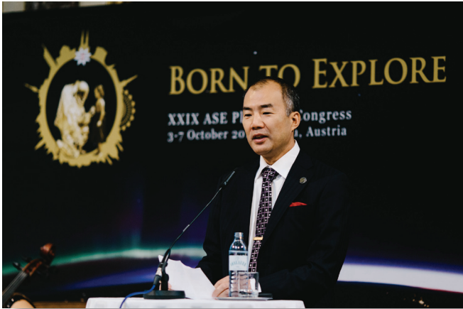
ASE President Soichi Noguchi welcomes dignitaries and guests and officially opens the XXIX Congress on behalf of the ASE membership and Executive Committee

US astronaut Stephanie Wilson and Russian cosmonaut Alexei Leonov shared the Keynote address and both shared the formative experiences that inspired them on the path to space. Leonov shared his memories of getting to know and working with the US members of the Apollo-Soyuz flight crew, and recalled the poignant moment when he realized that “these were people that we could work with – that we were all born to explore”.